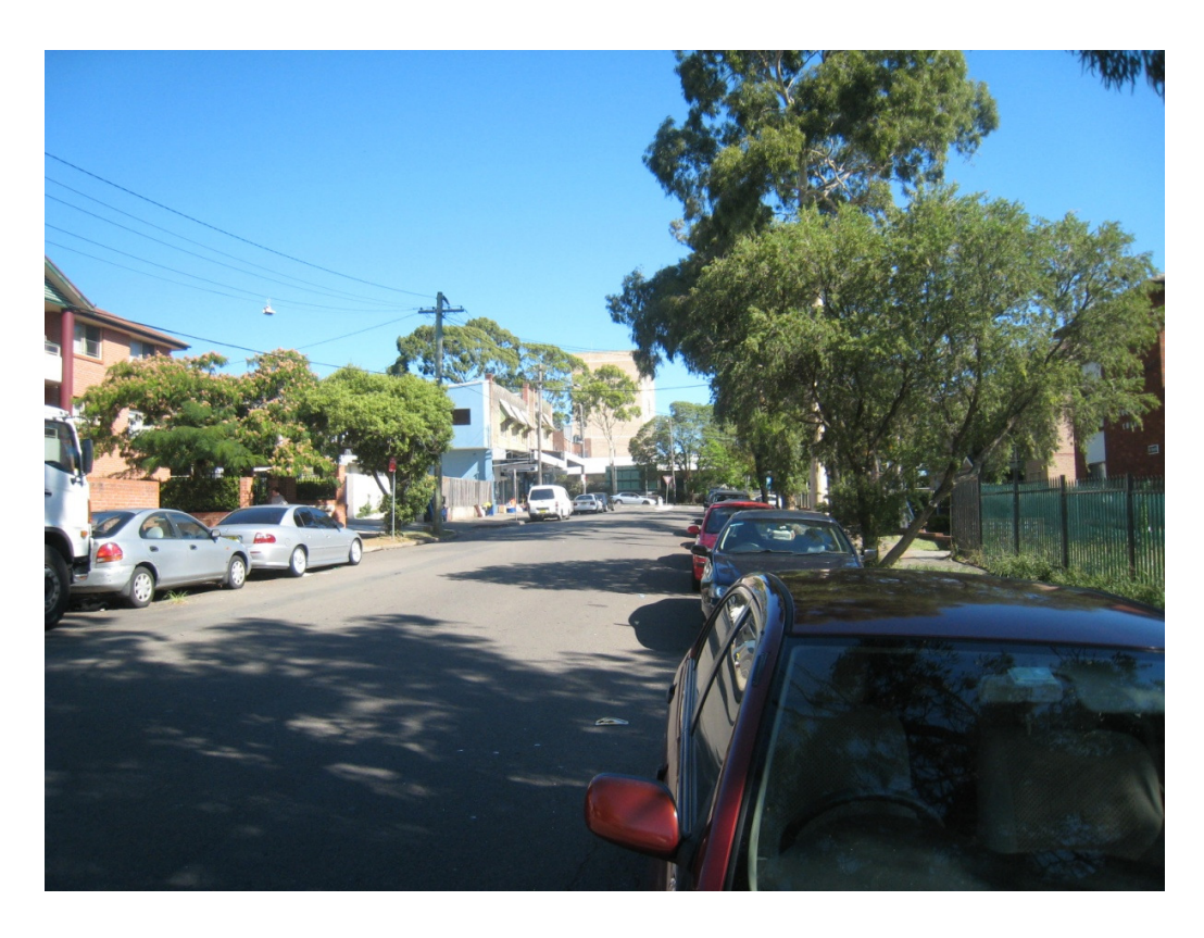
Photograph 3: View to site from Railway Parade (outside Lakemba Station)