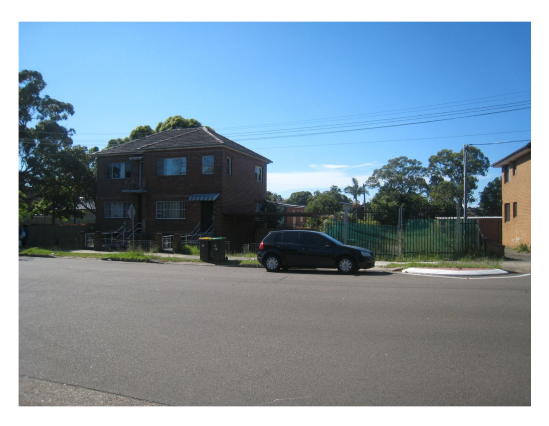
Photograph 5: Site as viewed from Jubilee Reserve