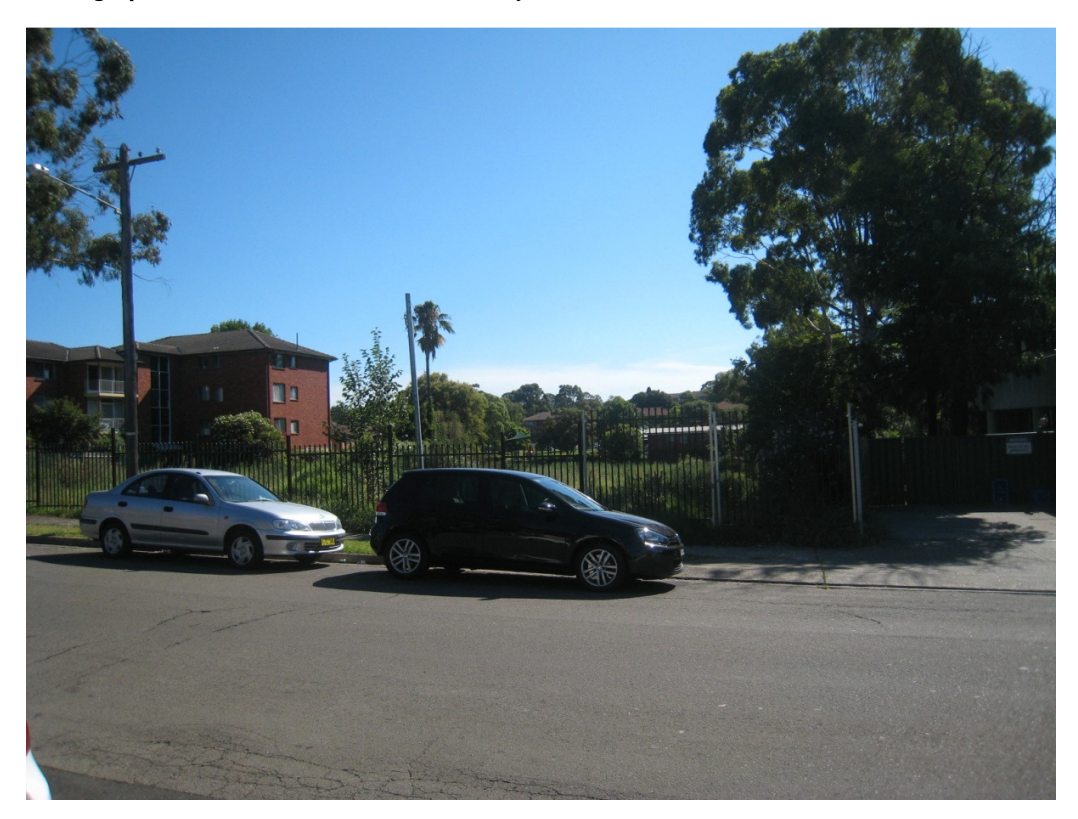
Photograph 2: view from Croydon Street Frontage to Lakemba Local Centre and Lakemba Station (Railway Parade).